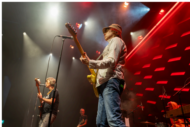
Sloan performing to a sold out audience