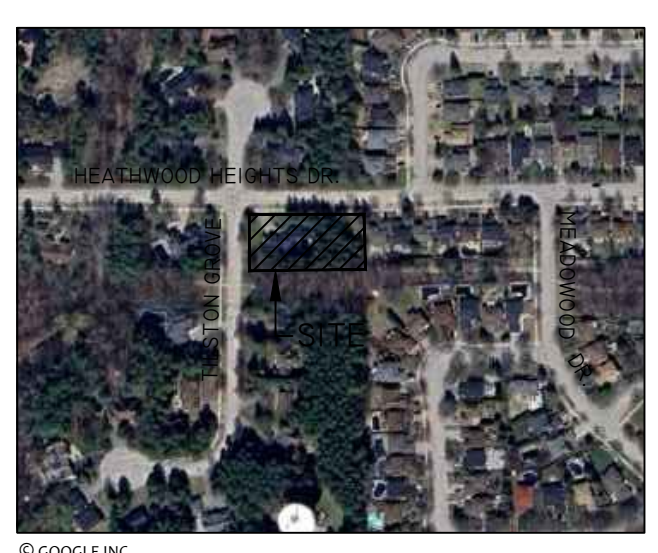
LOCATION PLAN N.T.S.