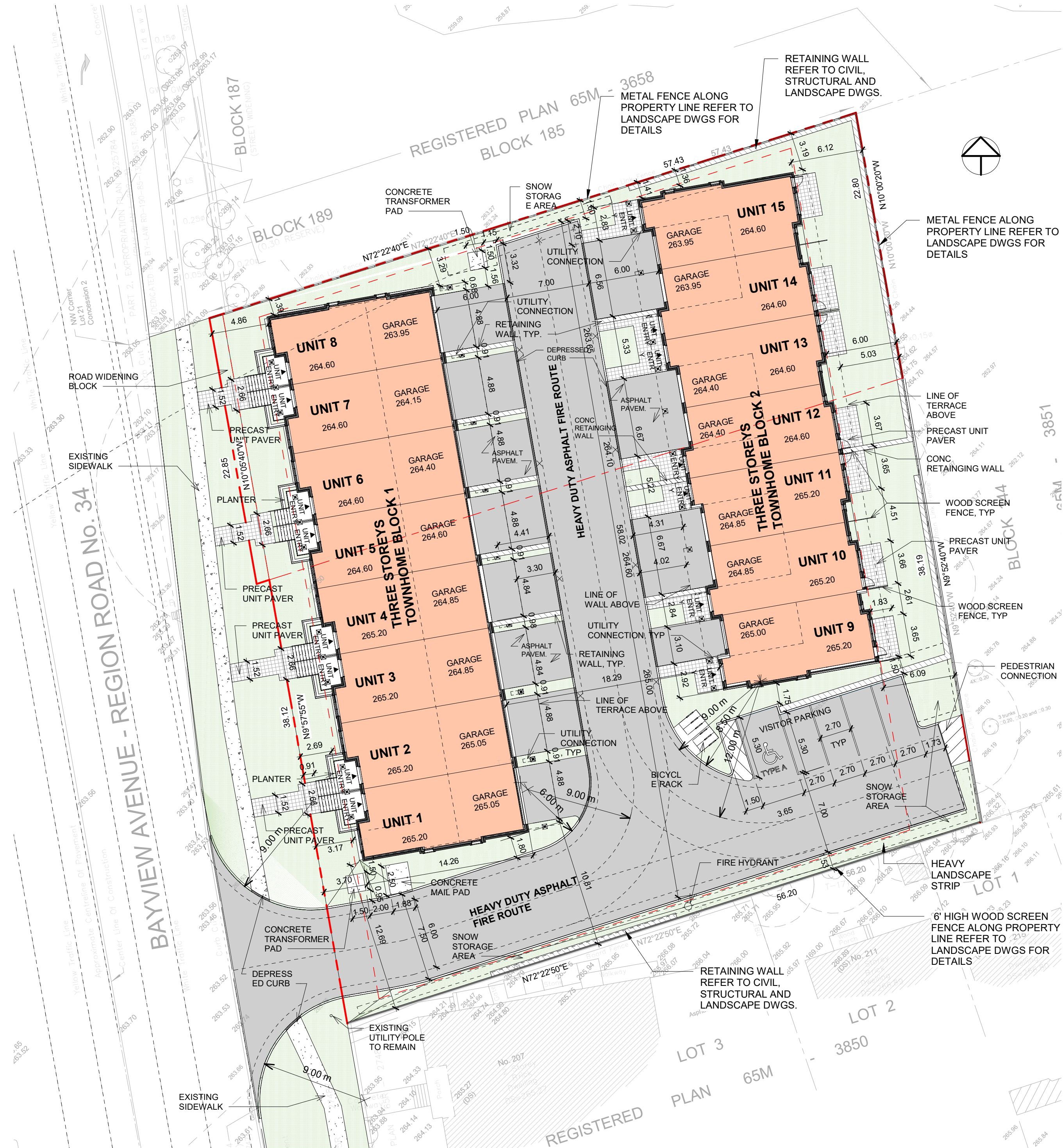
1 Site Plan 1 : 250

E:\2020\20002-15383 Bayview, Aurora\02 - Drawings\Revit\2002-Bayview Townhouse Aurora-2020.rvt 2020-12-12 10:18:56 PM