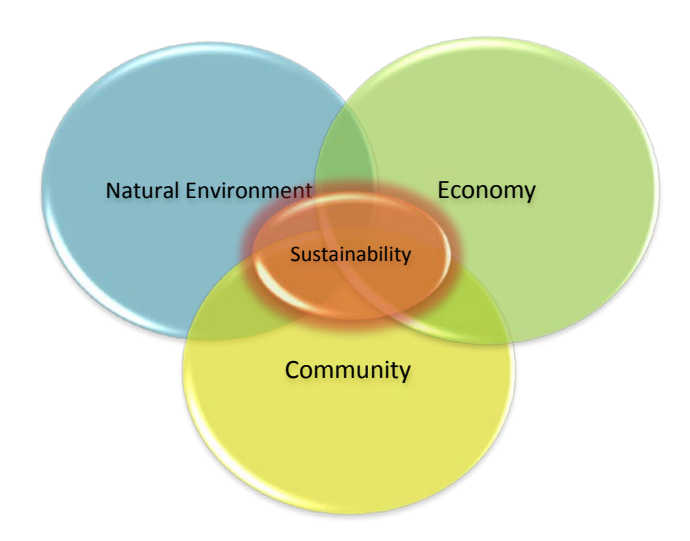
Figure 2: Sustainability Vision

Creating the CEAP is one of the ways the Town is continuing to advance sustainability and move us towards a sustainable community. Aurora will be integrating the Community Sustainability vision in decision-making processes that will interconnect the natural environment, the economy, and the community (as illustrated in Figure 2 below).