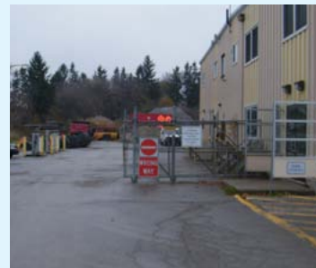
Poor site access and public entrance, which does not meet accessibility requirements.