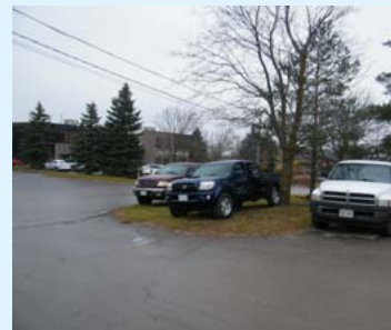
Lack of indoor vehicle and equipment storage. Shortage of parking for staff and visitors.