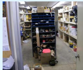
Poor outdoor and indoor material storage space.