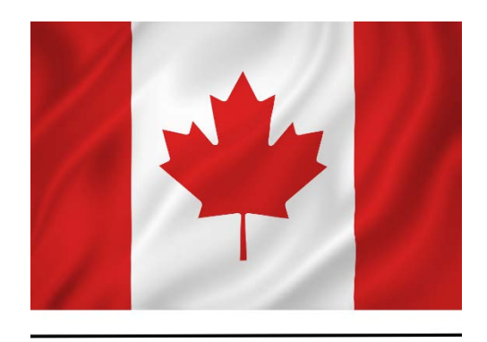
CIVIC HOLIDAY WEEKEND Saturday, August 5 to Monday, August 7

Have fun over the holidays! We have programs and activities for everyone to enjoy. Visit our <u>Holiday Schedules</u> webpage for full details.