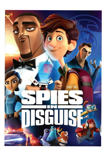
THURSDAY. AUGUST 31

Enjoy special pre-movie crafts and activities.