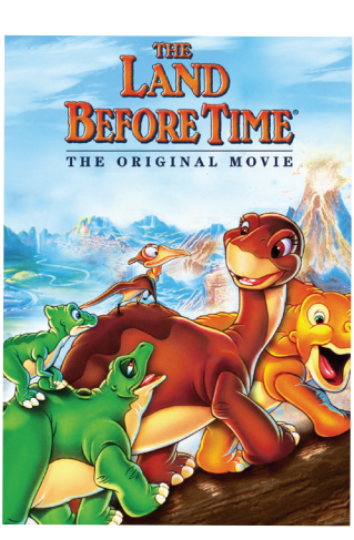
THURSDAY, AUGUST 24