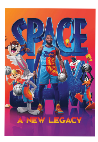
THURSDAY, AUGUST 17