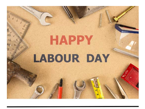
LABOUR DAY WEEKEND Saturday, September 2 to Monday, September 4