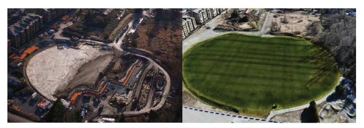
Figure 1: Before and after. Upon completion, this is now one of the largest underground stormwater detention systems in North America.

Qualico required a stormwater storage system to accommodate runoff for a 56-hectare catchment. McElhanney's non-traditional solution is one of the largest underground stormwater storage systems in North America and the system's ability to overcome typical project complexities impressed the client. Combining the facilities and placing the system underground allowed McElhanney to deliver Qualico added project benefits such as using less land, providing reduced long-term maintenance costs, benefits to the environment, and increased safety for residents.