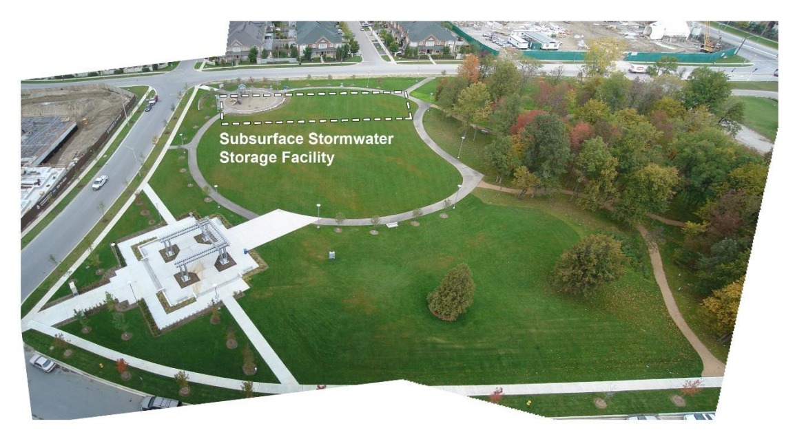
Thornhill Village Green - Thornhill

Examples of underground stormwater management facilities: