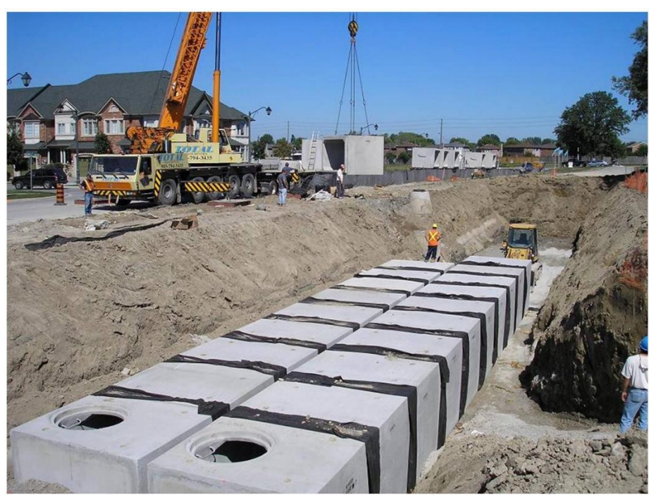
Subsurface Stormwater Storage Facility