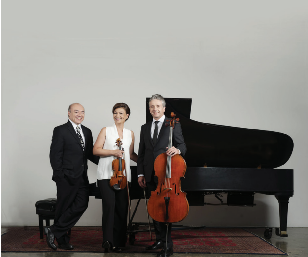
Gryphon Trio Great Artist Music Series