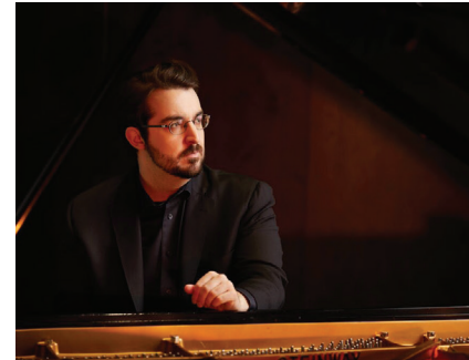
Charles Richard-Hamelin, piano Great Artist Music Series

📍 Location: NC Aurora Armoury, Aurora 🎫 $40 (HST INCL)