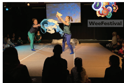
Paper Playground – Performed by Foolish Operations (B.C.)