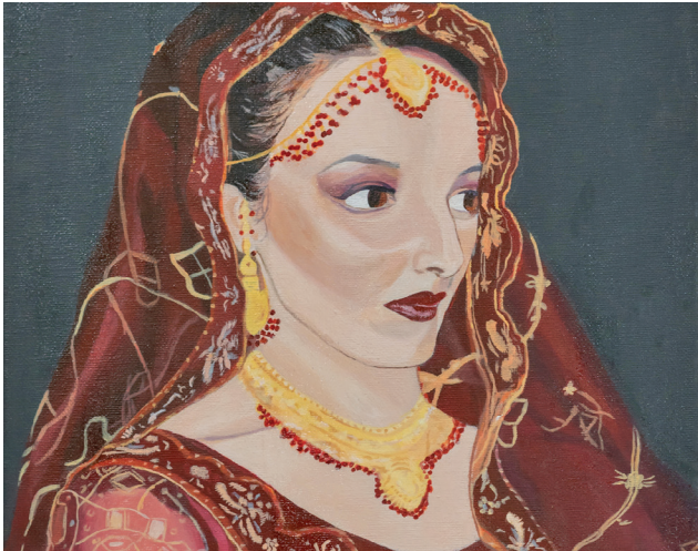
Zunairah W - Unveiled (2023) Zunairah Waqas; Acrylic on Canvas, 15.5 X 12 in