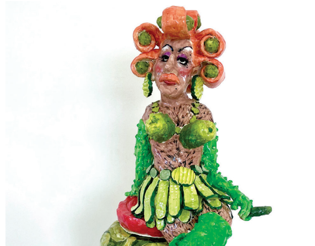
Dressed to the Brines (2023) by Jonah Strub, Glazed stoneware and fake eyelashes, 27 x 10 x 15 in

• To learn more about our gallery events, visit our website at AuroraCulturalCentre.ca