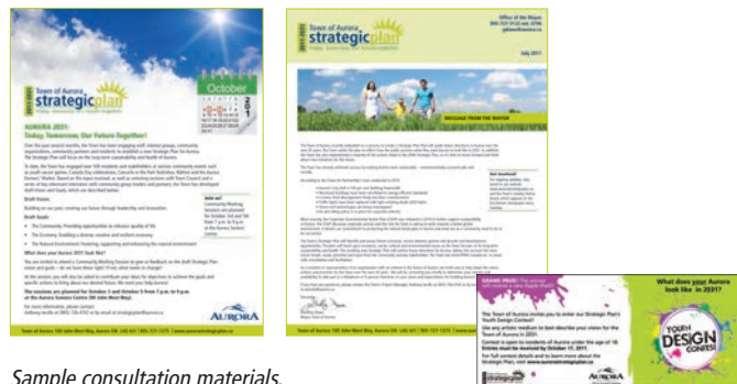
Sample consultation materials.

Council and Steering Committee members were provided with updates throughout the Strategic Planning process. Key information, revisions and next steps in the process were presented regularly.